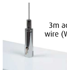
3m adjustable wire (WS option)